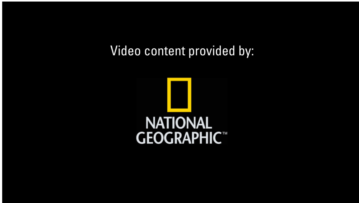
First credit screen

Screen 1 is available for the contributor to use as they see fit. See example below.